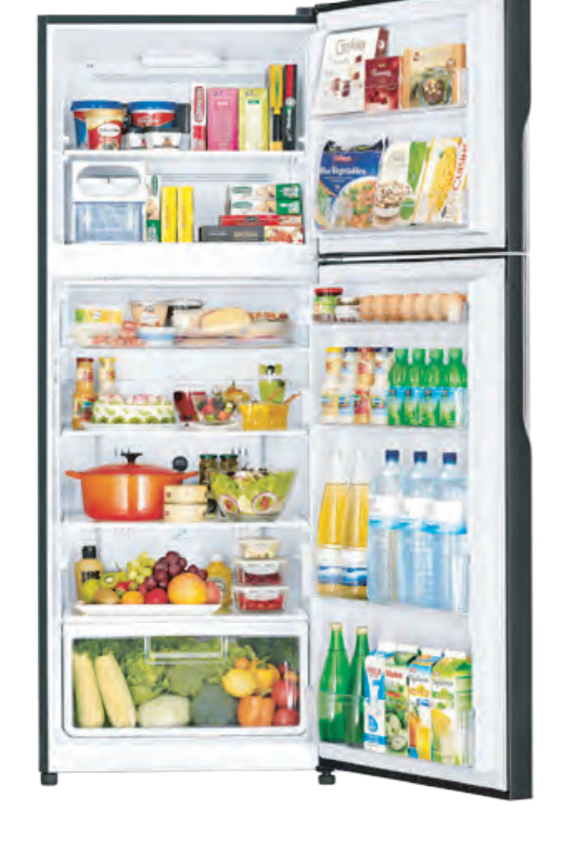
R-V405PT5INX INOX Finish