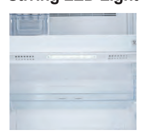
Refrigerator compartment features LED lighting that lasts a long time and consumes much less energy than conventional lamp.