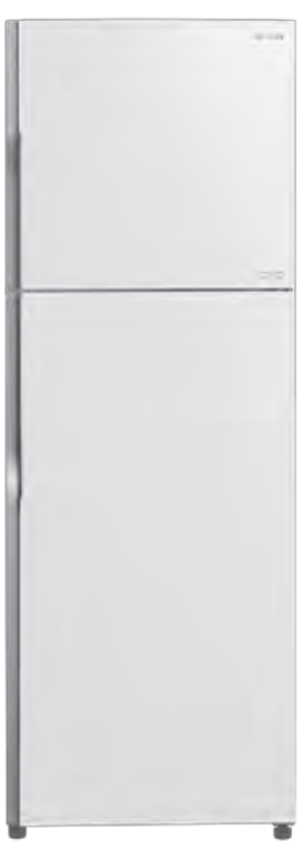
R-VG405PT5GPW White Glass Finish