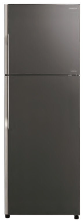
R-VG405PT5GGR Grey Glass Finish