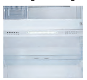
Refrigerator compartment features LED lighting that lasts a long time and consumes much less energy than conventional lamp.